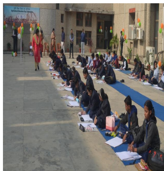
Participation in Drawing & Painting events (Class1-6 & Class 7-12)