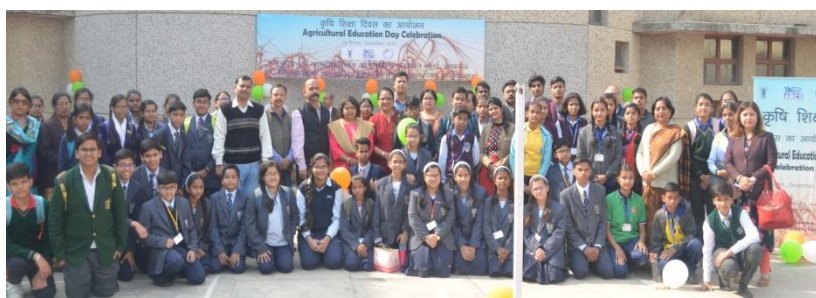
Participation in Drawing & Painting events (Class1-6 & Class