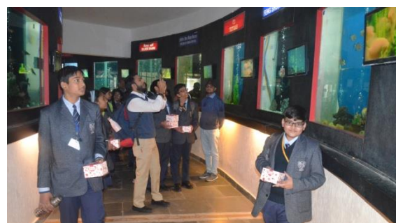
Awareness on Aquatic life through