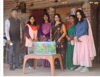
Visiting Villages Barakheda and Unchdwar at Unnao to understand ground level problems