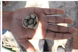
Local design studio session with sustainable materials to create prototypes for custom made mini aquariums